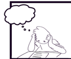
Michelle thinks to herself: "There's not enough time to figure this out. ___ such a terrible procrastinator!"

person was speaking/thinking to themselves. People filled in the blanks in self-talk sentences of 3 types (6): (i) copular sentences with expressive nouns/epithets (e.g. loser , terrible procrastinator , born superstar , genius ), which allow both you and I , (ii) imperatives and (iii) attitude verbs (e.g. think , believe , hope ). (Attitude verbs are more clearly defined than ‘verbs of cognition’.) Crucially, both epithets and attitude verbs involve an attitude holder (~ ‘judge’) but only in attitude verbs is the attitude holder also the subject (and can be pronominalized ). We also manipulated valence (neg/pos sentiment about the self).